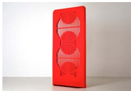
Freestyle floor screen