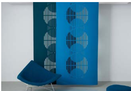
Solar hanging screen